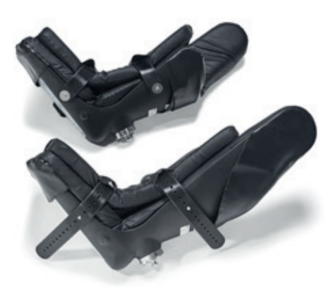
Standard knee crutch (black) can support patients up to 160 kg/352 lbs

Patient comfort: The blade interface makes it possible to place the patient's leg closer to the rotation point of the hip. This reduces strain on patients who have a limited range of motion in the hip joint. Side wings are included with the knee crutches to improve stability of the patient's leg and prevent the leg from going outward.