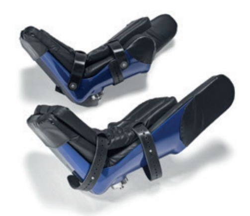
Adipositas knee crutch (blue) can support patients up to 250 kg/551 lbs

Patient comfort: The blade interface makes it possible to place the patient's leg closer to the rotation point of the hip. This reduces strain on patients who have a limited range of motion in the hip joint. Side wings are included with the knee crutches to improve stability of the patient's leg and prevent the leg from going outward.