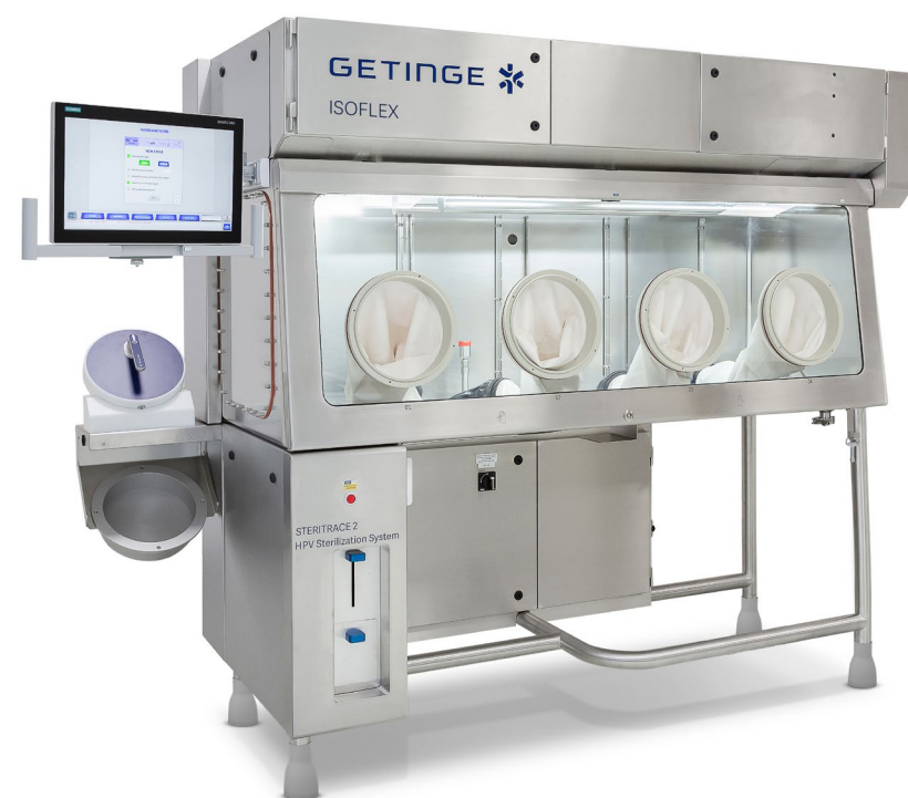
ISOFLEX Isolator A modular, rigid-wall isolator

The ISOFLEX Isolator protects the product against contamination during aseptic operations such as sterility testing. The rigid-wall isolator maintains an enclosed and sterile environment throughout transfer, manipulation, and bio-decontamination.