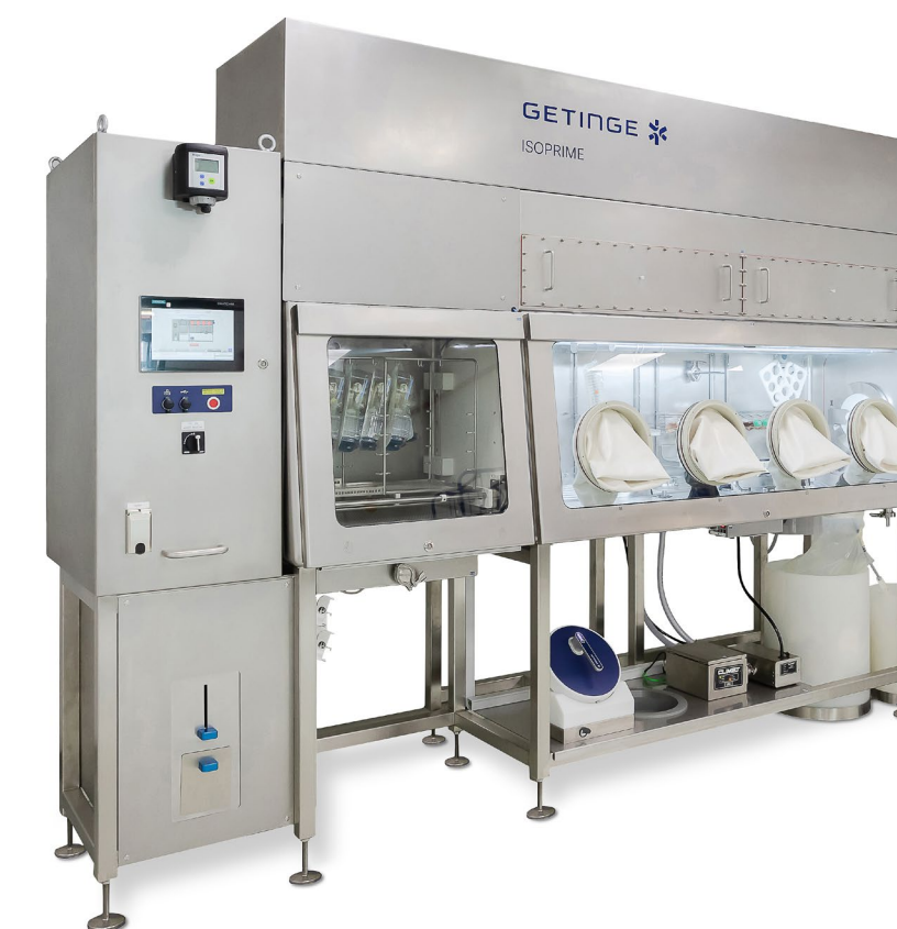
ISOPRIME Isolator Optimized for common aseptic applications

The ISOPRIME is the ideal solution for customers with modular rigid-wall isolator requirements that combine high-quality, versatility and continuous operations at a competitive price point.