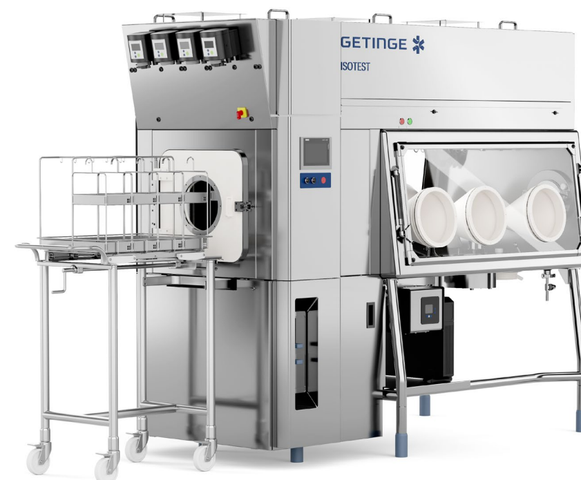
ISOTEST Isolator Efficient and reliable sterility testing processes

ISOTEST is an isolator designed for sterile applications, including sterility testing of sterile drugs, components, and devices. Continuous workflow, easy access, and fast bio-decontamination help to increase productivity.