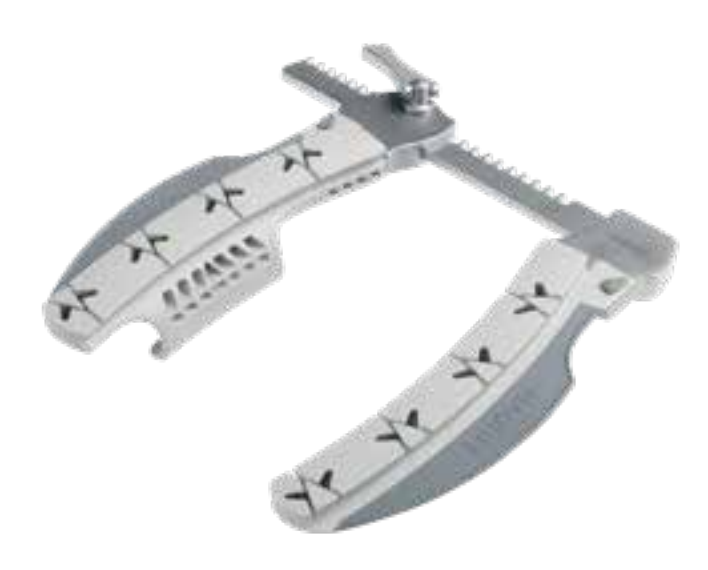
Activator II Drive Mechanism