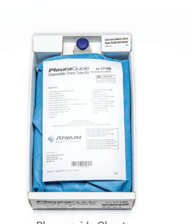
Pleuraguide Chest Tube Insertion Kit