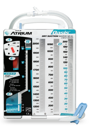
Atrium Oasis Chest Drain

* Available in single collection, dual collection, infant/pediatric, and autotransfusion (ATS) configurations.