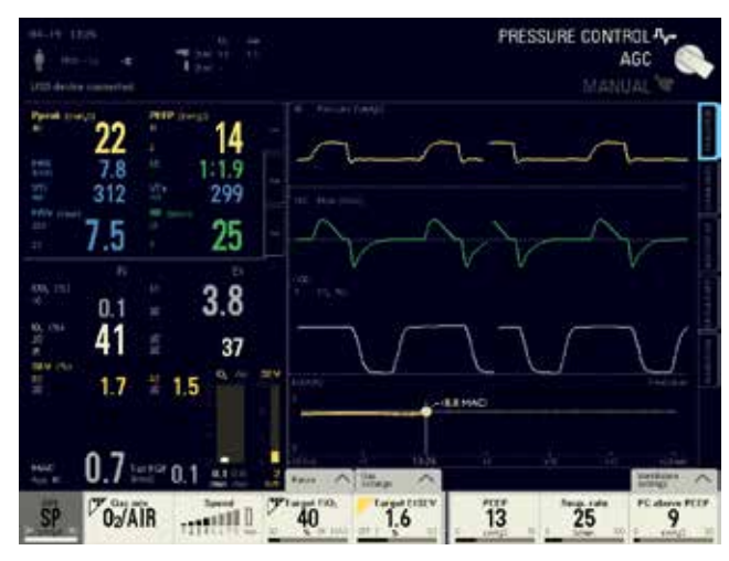
Figure 1: Example case demonstrating flows as low as 0.1 l/min during steady state anesthesia.

On the basis of the positive results achieved, the Royal Belfast Hospital for Sick Children subsequently decided to run its own study.