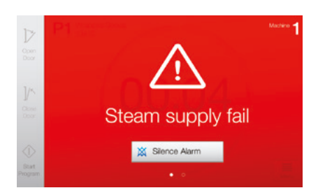
Every triggered alarm comes with clear on-screen directions for what action to take.

Solve problems or access advanced features directly from the clear, easy-to-understand user interface.