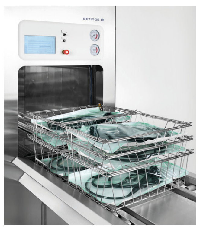
Automatic loader and unloader for baskets (GL64B)