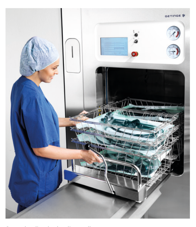
Smart loading/unloading trolleys

Getinge's innovative, automatic, one-point loading solution improves throughput for CSSDs with multiple sterilizers. The moment a sterilizer is free, a new load is automatically picked up and loaded – providing maximum availability and full resource utilization.