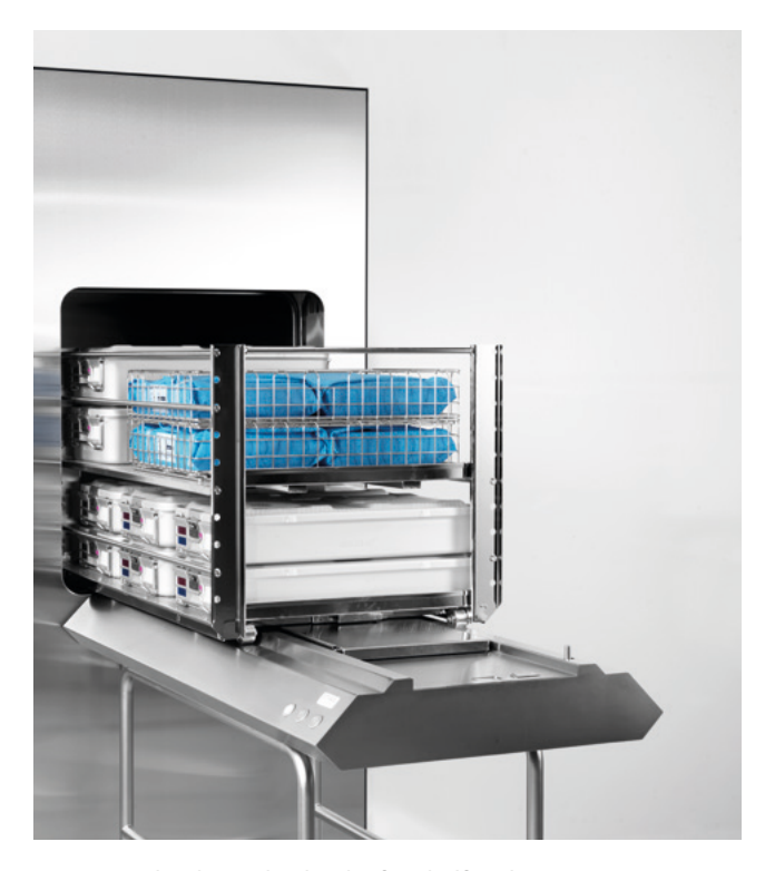
Automatic loader and unloader for shelf racks (GL64SR)

We offer complete, efficient, economical, and ergonomic handling systems for baskets as well as containers. Whether automatic or manual, we tailor every detail to make work easier and more efficient for every CSSD, whether you have one sterilizer or ten.