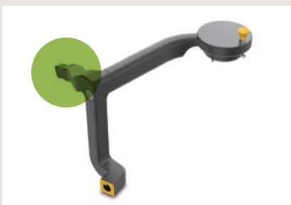
Compact Holder can be attached to the left or the right side of the Rotaflow II device handle or to the Fixation Point.