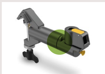
Fixation Point attaching the Compact Holder to a standard rail (vertical or horizontal) or a vertical round pole, such as on a mast.