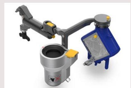
Compact Holder with Fixation Point, Rotaflow II Drive and the PLS module combines the components in one ergonomic holder concept.