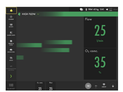
When setting ventilation parameters, the Safety Scale<sup>™</sup> tool allows you to tailor your settings quickly, intuitively and safely.