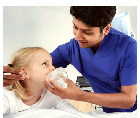
Servo-air can be used for non-invasive and invasive ventilation without changing the breathing circuit, only the patient interface.