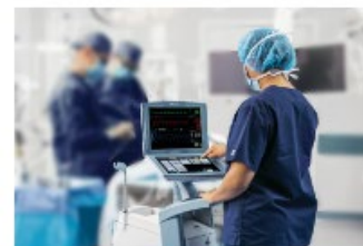
Intra-aortic balloon pump & catheters