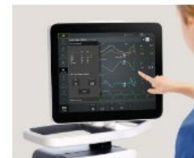
Mechanical ventilation & neurally adjusted ventilatory assist (NAVA)