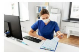
Ethics & compliance