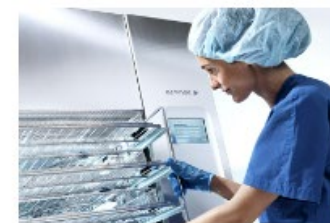
Cleaning & disinfection