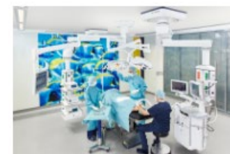
Ceiling Supply Unit