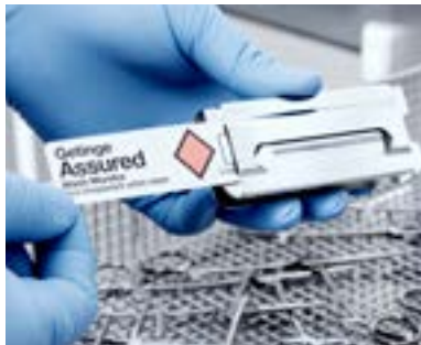
Wash monitor with holder