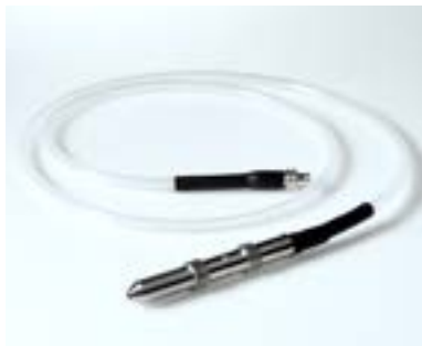
Lumen monitor (flex)