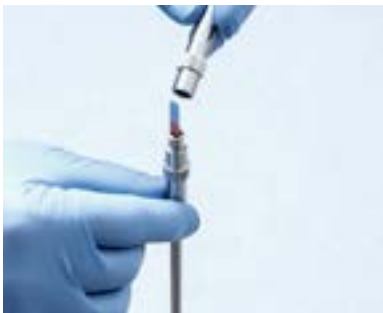
Lumen monitor (rigid)