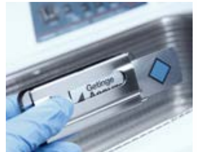
Wash monitor ultrasonic with holder