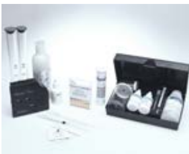
Water test kit