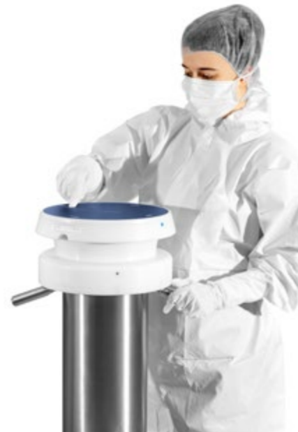
Integrity testing using Getinge's wireless, pipeless Transfer Leak Tester