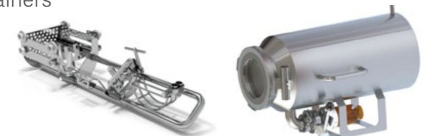
Customized autoclavable stainless steel and plastic insert

Inserts, dimensions, parts and finishing to customers' requirements