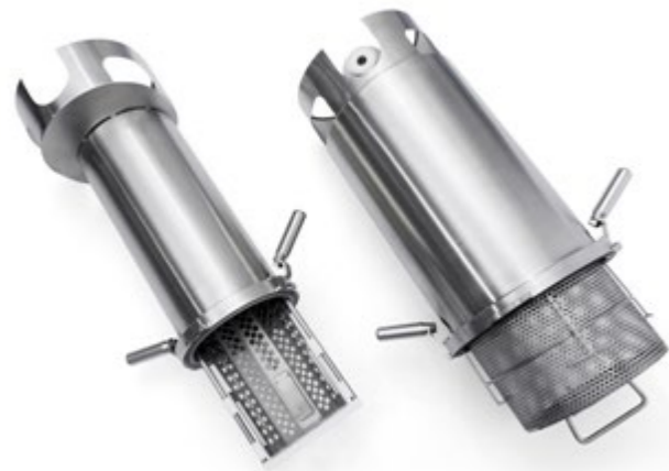
Inserts are available for Level 2 containers upwards

Getinge's DPTE® Beta containers are compatible with any DPTE® Alpha port of the same diameter. The patented safety interlock prevents manipulation errors.